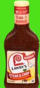
Lawry's Marinades 12 oz