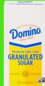
Domino Granulated Sugar 16 oz