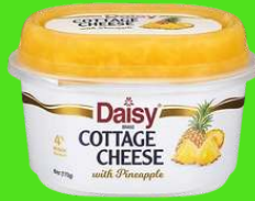
Daisy Cottage Cheese With Fruit 6 oz