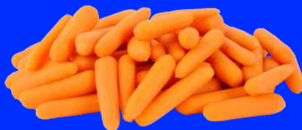
Baby Carrots 16 oz