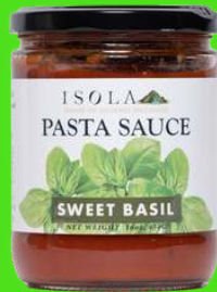
Isola Sweet Basil Pasta Sauce 16 oz