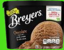
Breyer's Ice Cream 1.5 Quart