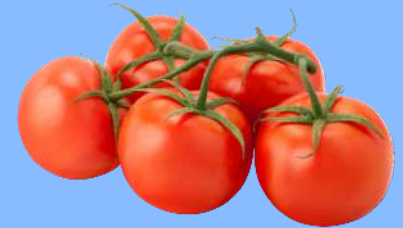
On The Vine Cluster Tomatoes