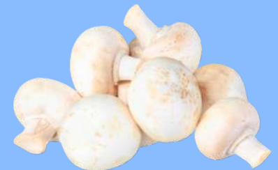
White Mushrooms 16 oz Package