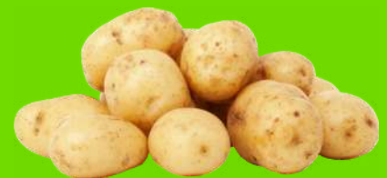
Yukon Gold Potatoes 3 LB Bag