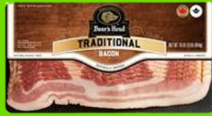
Boar's Head Bacon 16 oz