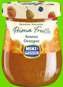
Prima Frutta Jams 12 oz