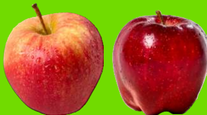
Fuji or Red Delicious Apples