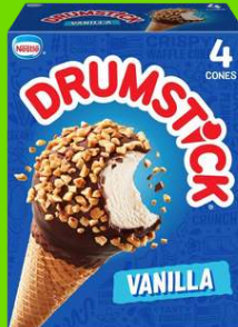
Nestle Drumsticks 18 oz