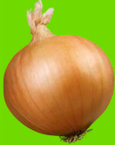
Sweet Onions or Brussel Sprouts