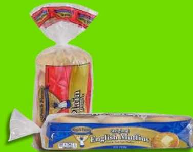
Dutch Farms Muffins & Bagels