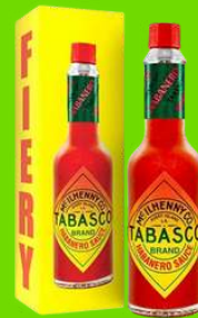
Tabasco Habanero Hot Sauce 2 oz