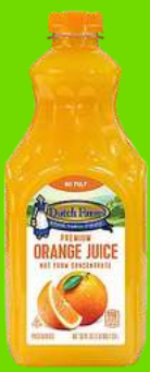
Dutch Farms Orange Juice 52 oz