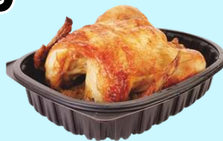
Homemade Rotisserie Chicken