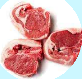
Domestic Lamb Loin Chops "Great On The Grill" $11.99/LB