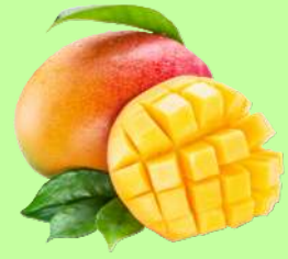
Mangos 2 For $2.50