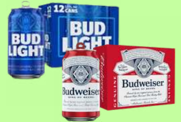
Bud Light 12 Pk 12 Fl Oz Cans $14.99