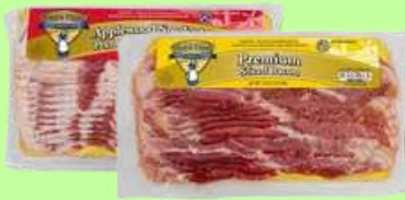
Dutch Farms Bacon All Varieties 16 Oz $4.99