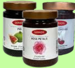
Saradis Greek Fruit Sweets In Syrup 16 OZ $4.99