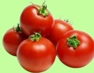
Hydroponic Beefsteak Tomatoes $1.19 /LB