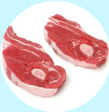
Lamb Round Bone Or Blade Shoulder Chops $7.99/LB