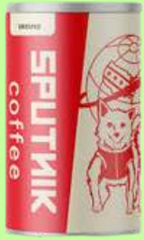
Sputnik Coffee Grounds 8 Oz $7.99