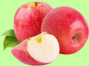
Pink Lady Apples $.89 /LB