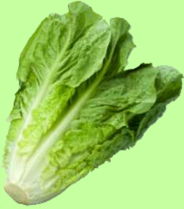
Romain Lettuce $.99 /EA