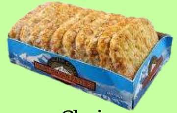
Glacier Gold Hash Brown Patties 10 Ct $3.99