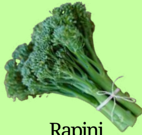
Rapini $1.29 /EA