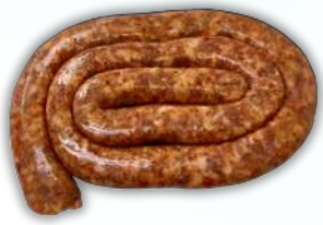
In-House Delicious & Tasty Sicilian Sausage Made With Natural Sheep Casings $4.99/LB