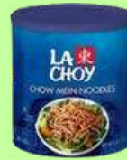
La Choy Chow Mein Noodles 5 Oz 2 For $4