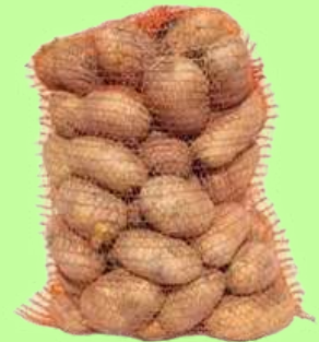
Idaho Potatoes 2 For $5 /5 LB Bag