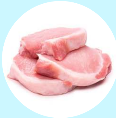
Fresh Cut Center Cut Pork Chops $2.99/LB