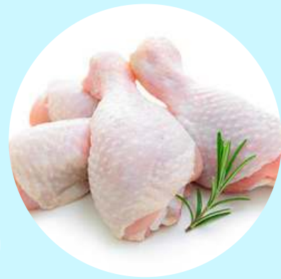
Grade "A" Fresh Jumbo Chicken Drumsticks $.89/LB