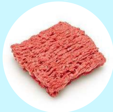
Ground Daily Angus Ground Sirloin $8.99/LB