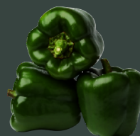
Green Peppers $.98/LB