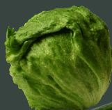
Seedless Cucumbers Or Head Lettuce