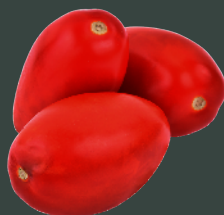
Roma Tomatoes $.88/LB