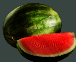
Seedless Watermelon $5.98/EA