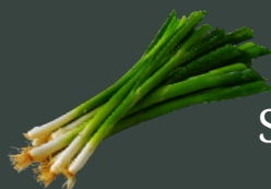
Green Onion $.38/EA