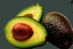
Large Avocado $1.98/EA