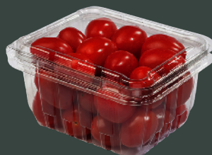
Grape Tomatoes 10 Oz Cont. $.98/EA