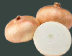
Sweet Vidalia Onions $.78/LB