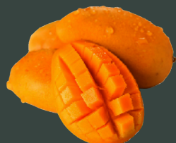
Manilla Mangos $.48/EA